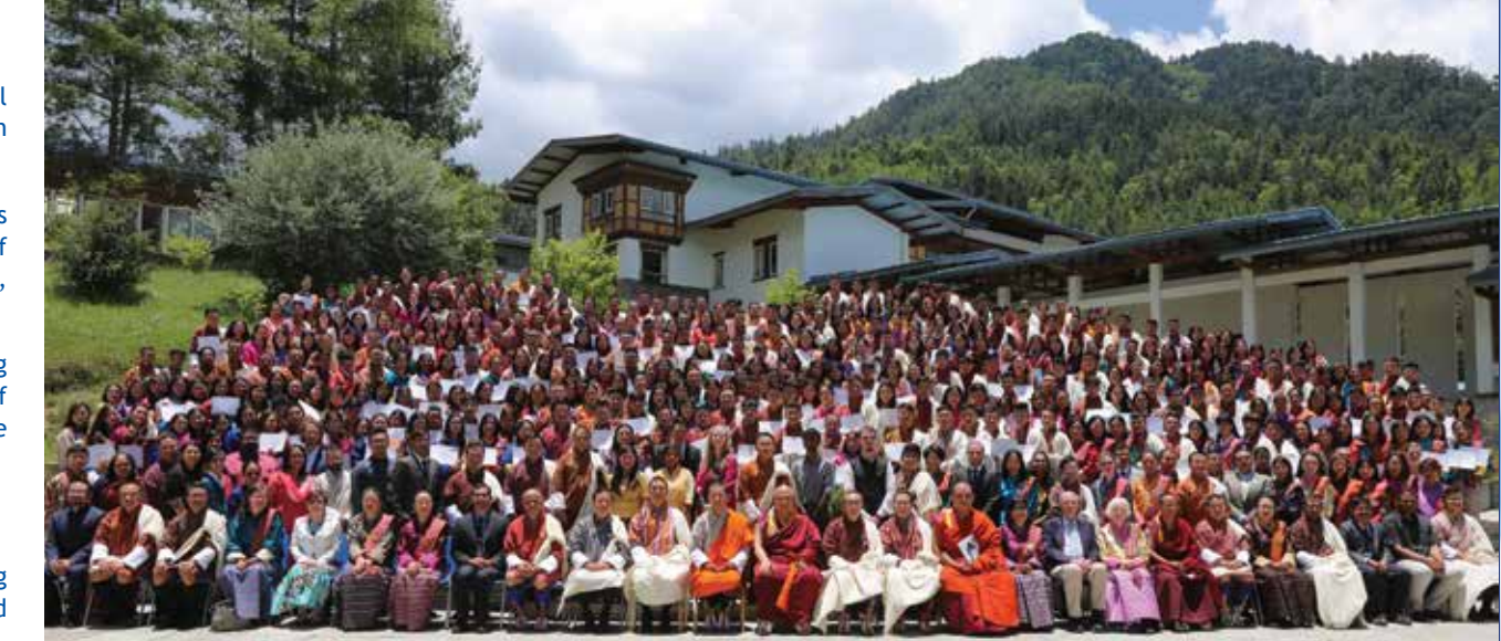
Graduating Class of 2019