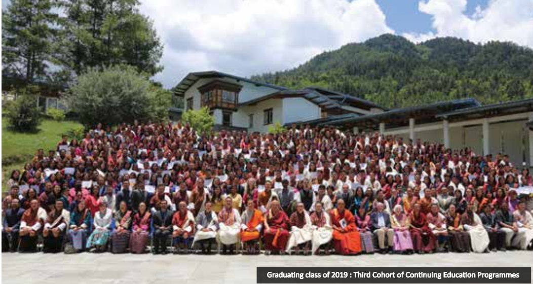
Graduating class of 2019 : Third Cohort of Continuing Education Programmes

The CE programme at RTC is well-suited for highly motivated individuals with good time management skills and a desire to put in the hard work required to complete a full University degree over four years. CE students typically have to balance their professional duties, their personal commitments (such as family), and their academics. CE students will be expected to meet the RUB requirements fully equivalent to those for regular day students, while maintaining this balance. Typically, the time commitment required to excel in a CE course is approximately one hour of out-of-class time for every hour spent in-class, which may come to 12-16 hours/week spent on individual study and completing coursework assignments. Strong motivation and commitment will be key to successfully completing the four-year programme.