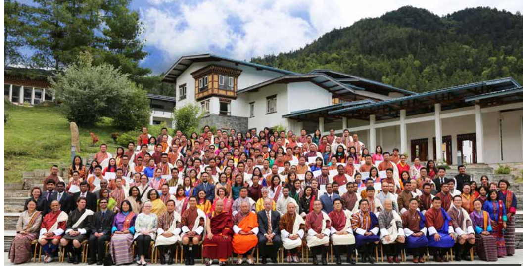
Graduating class of 2017 : First Cohort of Continuing Education Programmes