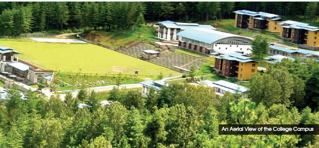
An Aerial View of the College Campus

The RTC CE Programme is geared to cater to the needs of those working professionals who would like to complete their education in the evenings, after working hours. Unlike the regular day-time RTC students who graduate in 3 years, CE students will take only 3 modules per semester in the first two semesters, and 4 per semester in the subsequent semesters. With this reduced workload per semester, a minimum of 4 years will be required to graduate from the CE programme.