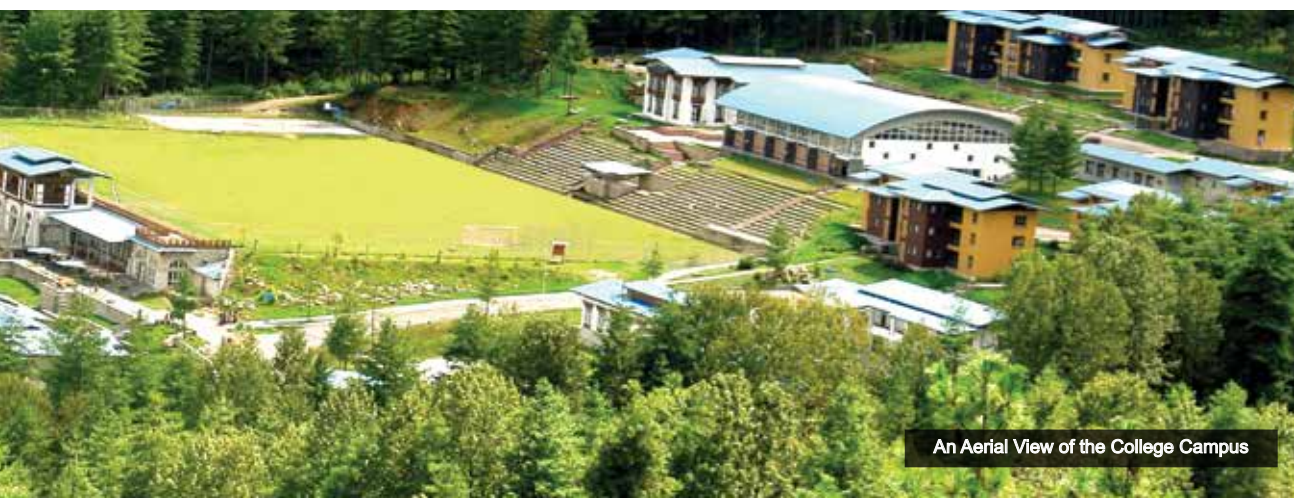
An Aerial View of the College Campus

This unique programme incorporates an international standard economics curriculum, emphasizes research, and helps graduates address what Bhutan and the global economy need right now and in the future. Upon successful completion, graduates will have adequate training to pursue careers as economists, development practitioners, policy analysts, civil servants, consultants, researchers, managers, businessmen, bankers, social leaders, political leaders, and academicians.