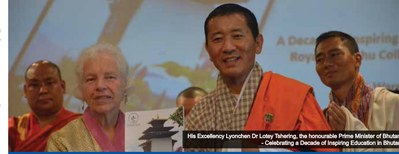
His Excellency Lyonchen Dr Lotey Tshering, the honourable Prime Minister of Bhutan - Celebrating a Decade of Inspiring Education in Bhutan